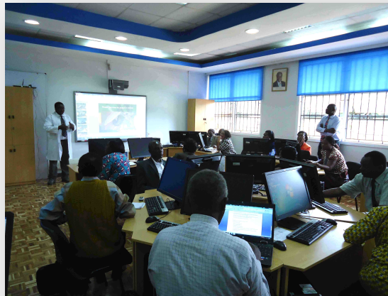
Workshop on Integrating Technology into Teaching

The overall objective of the Kenyatta University and Syracuse University partnership is to build capacity at the secondary school level through quality teacher preparation across the span of teacher education—from preservice teacher preparation, to novice teacher induction, to practicing teacher continual growth— through enhancing the capacity of Kenyatta University in its faculty, educational programs, research, and engagement with stakeholders that will result in improved secondary education in Kenya. Along with this objective, we have a long-term goal of developing and establishing a model for teacher preparation and education that we will share with other universities in Kenya and other East African countries.