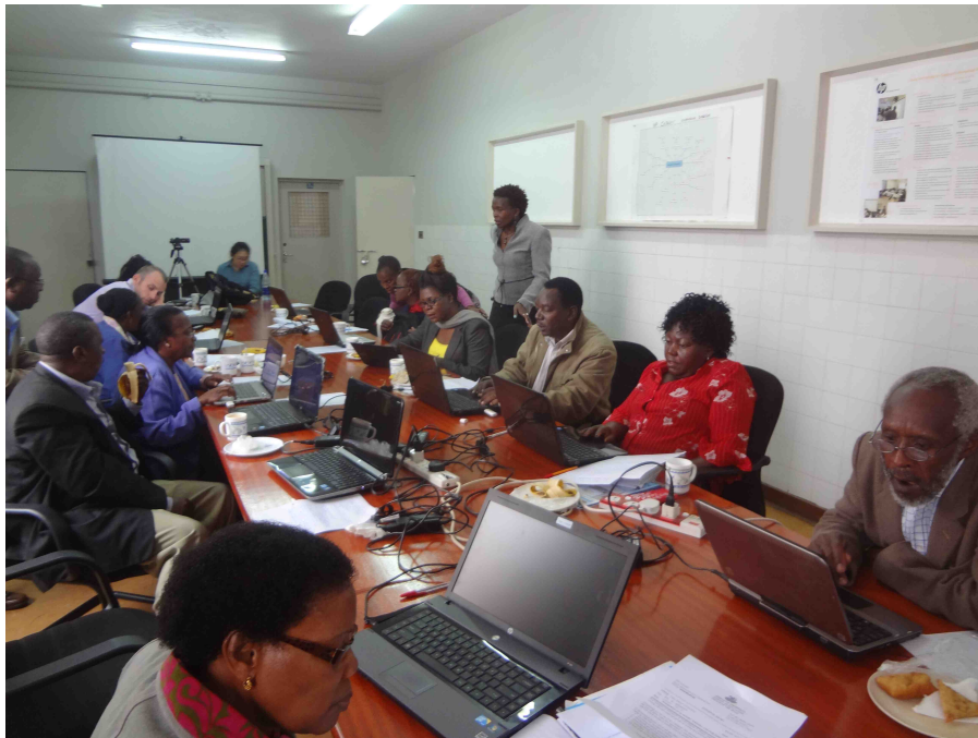
Participants work on creating their SurveyMonkey™ surveys

Training participants included Department of Educational Communication and Technology faculty members and graduate students, as well as several other guests from other departments or institutions.