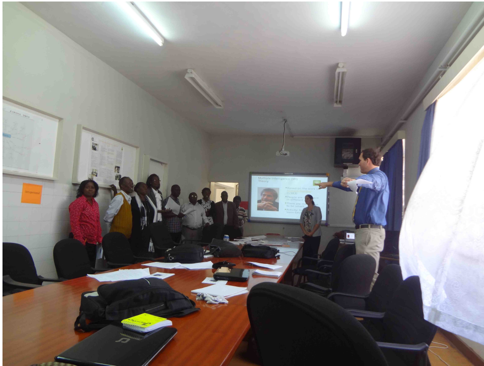
Participants line up by the sign indicating their primary intelligence