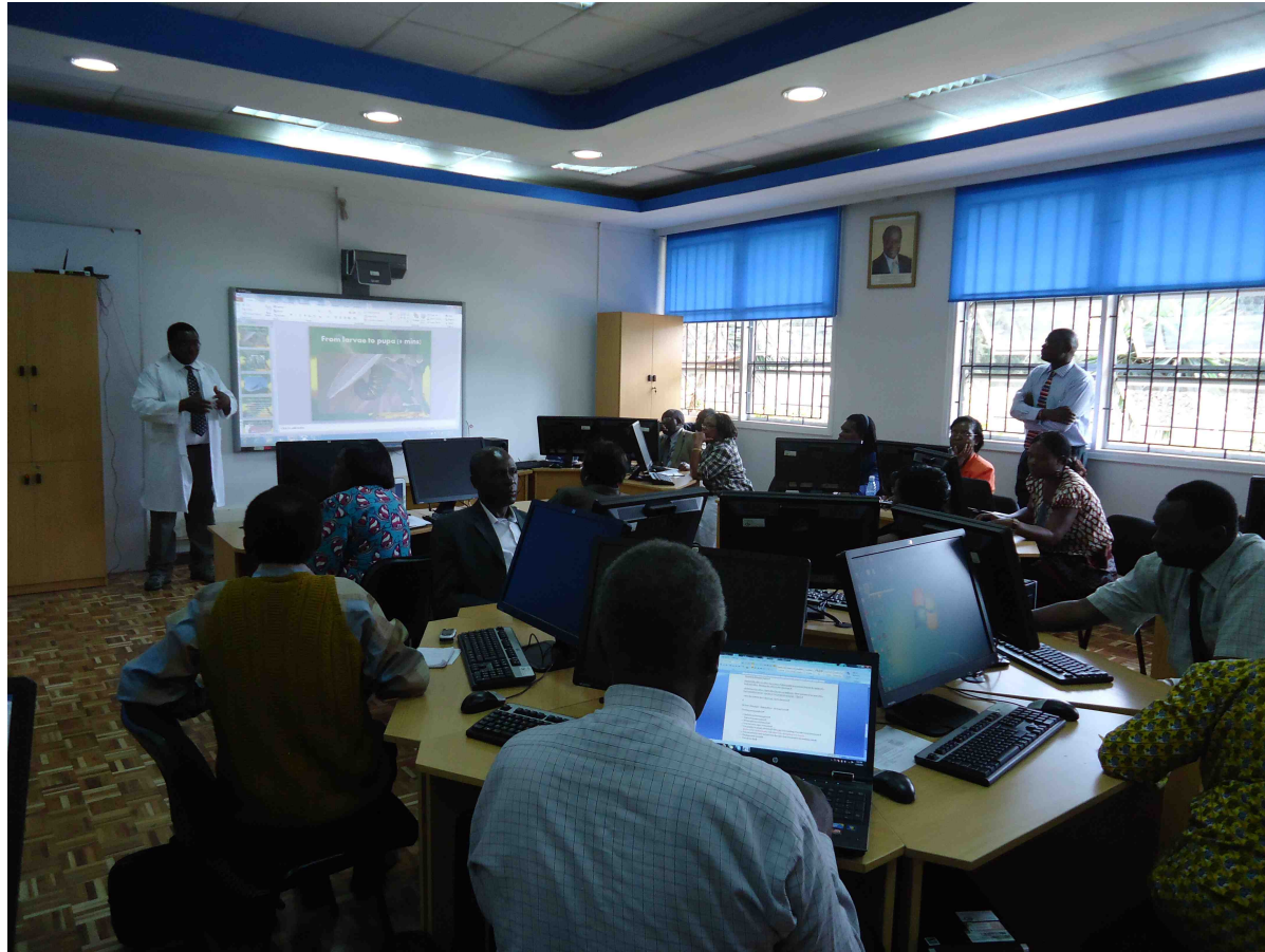
Workshop on Integrating Technology Into Teaching