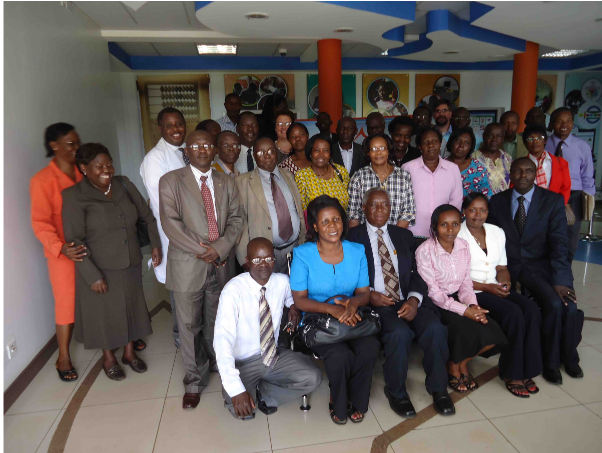
Participants in the Workshop on Integrating Technology into Teaching